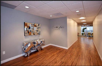
Reception Area (1)