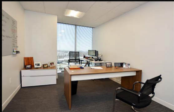
Window Office (4B)