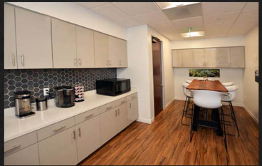
Break Area (6)