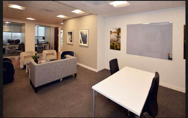
Open work area and Copy Room (7)