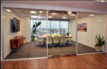
Main Conference Room (3)