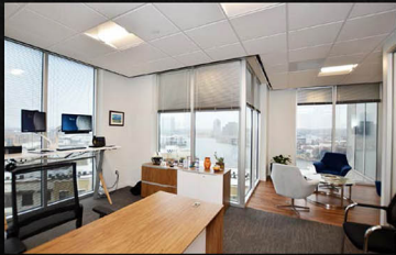
Executive Window Corner Office (5B)